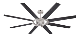
Reversible Wengue Finish Blades